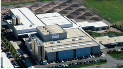
Productions centre for STARstrap™ strapping in Germany