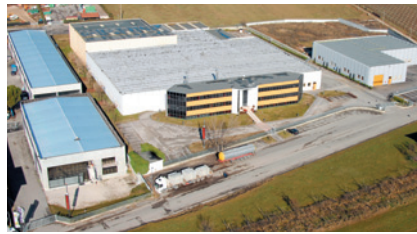
Production centre for machines and equipment in Italy