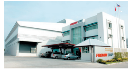
Production centre for STARstrap™ strapping in Thailand