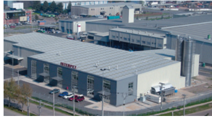
Productions centre for STARstrap™ strapping in Chile