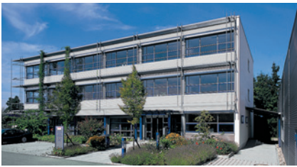
Development centre in Germany