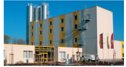
Polyester recycling plant in Germany