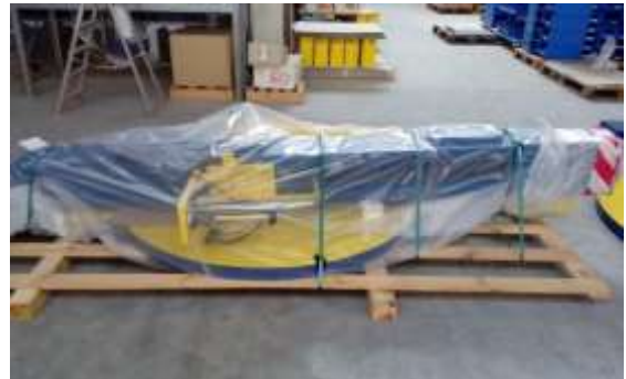
Fig.2 Packaging (second side)