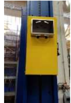
Fig.4 Remove yellow Togliere il carter