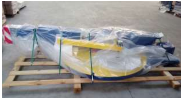
Fig.1 Packaging (first side)

Gruppo pressino acquistato con la macchina avvolgitrice serie FS3xx/FS1xx.